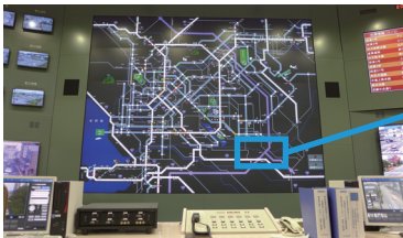
The 72-inch 20-screen Multi-Screen Systems as viewed from the control desk.

Simple operation enables a variety of image data to be displayed on the installed systems. For example, during events, such as marathons, or natural disasters, such as earthquakes, images from helicopters and other related information sources can be simultaneously displayed in addition to the usual displays. This allows traffic conditions to be grasped quickly and precisely from a variety of angles. On the one hand, the system has the ability to instantly display diverse information, while also remaining easy to operate and configure. It is designed so that, in the event of an emergency, people other than technical specialists, such as ordinary staff and police officers, can use it.