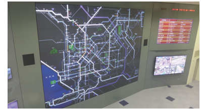
Crisp, clear displays are provided even through the glass windows of the upper floor.

Since the two Multi-Screen Systems operate 24 hours a day, all day and all night, they are set to a mode that will allow approximately 10 years of operation. By using DLP™ Laser Projectors, maintenance work is reduced, which is also expected to help reduce running costs over the long-term. The system is operated in "Long-Life 3" mode, which produces the lowest level of brightness, providing ample display clarity even in a brightly lit room. The wide viewing angle also allows crisp, clear visibility of various information even from the edges of the room.