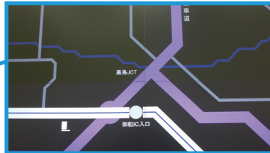
The joints between screens are hardly noticeable.