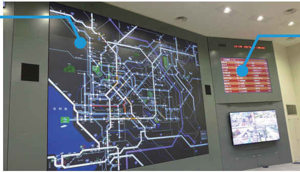
The traffic conditions of the entire Kumamoto region are displayed on the center screens. The screens at the upper right of the photo show congestion and other information in list format.