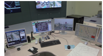
The images can be easily switched with the personal computer on the control desk.