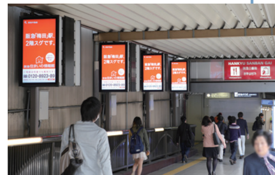
The 2nd Floor Connecting Bridge built for the passageway to JR Osaka Station has six dust-resistant/water-resistant displays. It provides bright, stable images even in the semi-outdoor environment with rainwater blown by the wind.

displays, the Panasonic system is highly appraised for its functions, stability, and low running cost. In addition to this, the wide viewing angle is an important point. As a result, a multi-screen system based on the TH-55LFV50 was selected. A total of 36 screens were used to form two systems, each one with 6 displays mounted horizontally and 3 vertically.