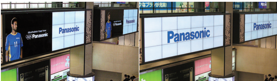
Display example for Umeda Twin Vision. Each multi-screen system can be used to show two screens (left), or a wide 32:9 screen (right).

The Umeda Twin Vision system, which is positioned immediately in front of everyone who walks from the 2nd floor central ticket gate to the 1st floor concourse, is a highly visible advertising medium with strong promotional power. The client has also strongly praised its large, dynamic screens and sharp, crisp images. The 2nd Floor Connecting Bridge displays are also located directly in the sight of the majority of people who pass by them, which greatly increases their promotional strength compared with the posters that were previously used. Furthermore, the fact that the content is so much easier to update than it was with the illuminated signboards that were used before makes advertising much more efficient. Mr. Uenaga explains, "This allows us to provide our customers with added-value transport media. We'll certainly consider these achievements in our future advertising plans."