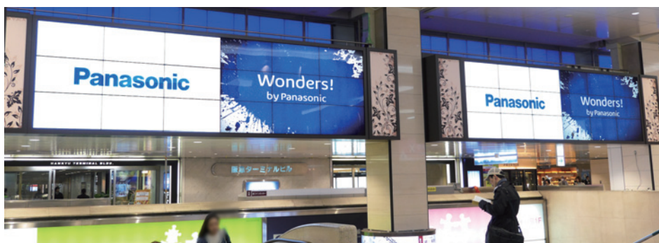
An overall view of Umeda Twin Vision. The huge, approximately 300-inch screens draw attention with their crisp images.

Considering the above, TH-47LFX6 displays were selected.