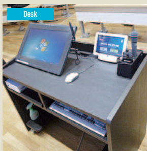
Operation tablet and pen tablet are placed on the desk. The tablets are connected wirelessly to the system so that the table with the tablets on it can be moved.