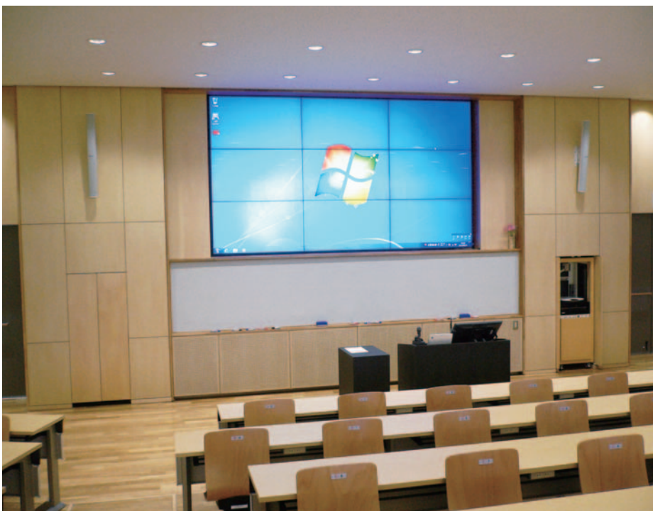
One of the large lecture halls installed with the multi-screen system.