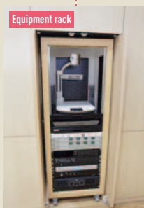
The video source devices, such as the BD player and document camera, are mounted in the rack together with other video devices. The rack is recessed in the front wall of each lecture hall, and the door can be opened for access whenever necessary. The rack can be pulled out from the wall for maintenance.