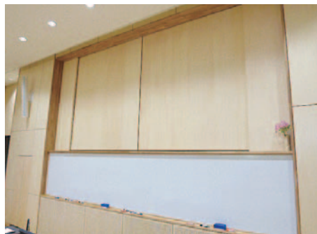
When only the whiteboard needs to be used in a lecture, the display surface can be covered.