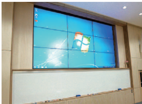
A whiteboard is installed below the display for a hybrid configuration.

Since the multi-screen systems were installed, there have been no complaints about the display being difficult to see in the bright room environments. Also, all students look squarely toward the front. This indicates that the new systems help students concentrate on the lecture. Presently, the multi-screen system and ordinary whiteboard are used in combination for hybrid operation in each room. However, since the pen tablet enables flexible writing on the multi-screen display, the university is thinking about a complete changeover to full-time display systems without using the whiteboards.