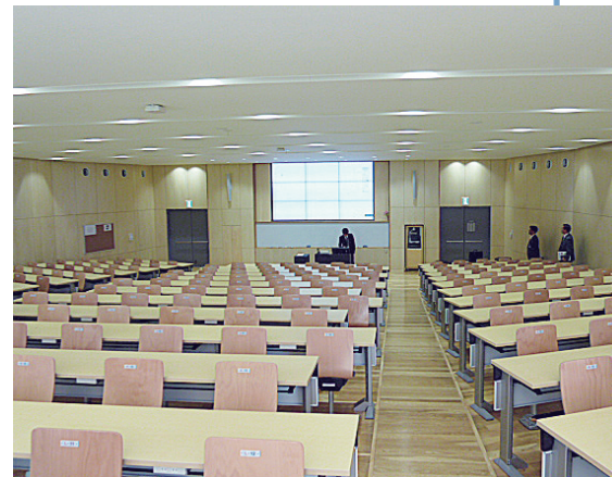
The large screen is easy to see even from the back of the room. Students only need to look at one large image, so it improves their concentration.

The university wanted to improve the concentration of students (230 to 270 persons) in the lectures given in each of the large halls. As a result, it decided to install a large multi-screen system in the front area of each room.