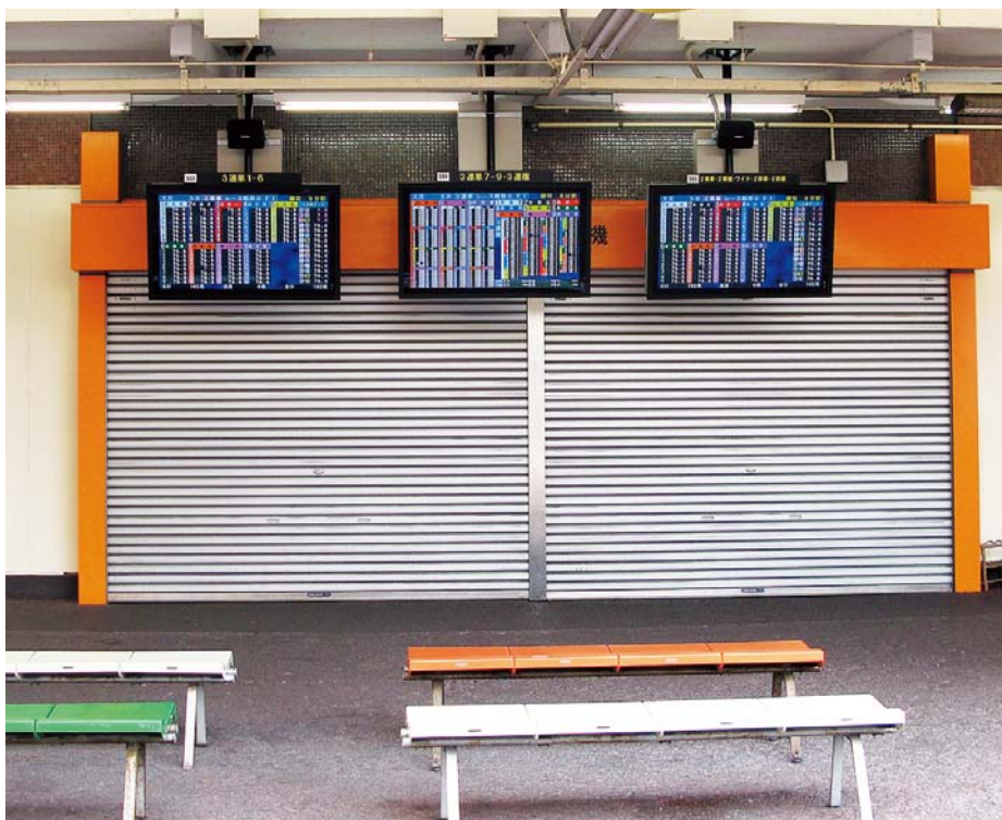
Displays are installed under the eaves. The surrounding area is very bright on clear days, but the images are constantly sharp and clear.