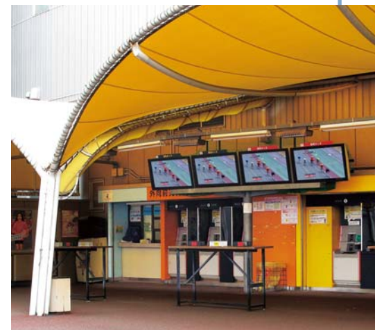
Waterproof performance was required for outdoor installation. Durable LCD displays are ideal because their wide operating temperature range withstands temperature changes.

A wide range of information, including betting odds and race results as well as live, high-speed race images, are displayed at the stadium. Until now, CRT displays were used to show this information, but they were all upgraded to consumer-type LCD TVs with Full-HD compatibility. However, the displays, which are installed at the outdoor ticket counters, must provide a high level of durability against wind and rain, and offer clear legibility even under bright sunlight conditions. These were difficult requirements for consumer-type TVs.