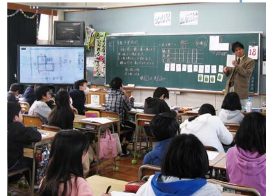
Information written onto a blackboard can be used together with enlarged PC materials and video camera images displayed on the Electronic Whiteboard. This enables effective classes while holding the students' interest.

A total of 85 ICT Systems were used, centering on the LFB70 Series high-resolution LCD display with a touch panel based on the Infrared Blocking Detection Method. Three of these ICT Systems were installed in