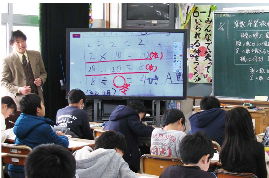
Students use the Boken Video Camera to record their handwritten notes, then enlarge and display them on the Electronic Whiteboard. Information can also be written directly onto the displayed images without having to use a PC, so the teacher can add additional comments during the classroom session.