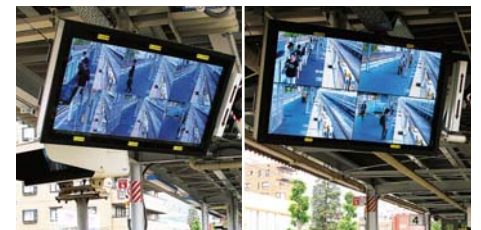
▲ The Platform Monitors for Conductors were installed based on the position that the train stops. The split six-screen display (pictured at the left) that shows images of 12 cars, and the split four-screen display (pictured at the right) that shows images of 8 cars can be used accordingly.

[Bottom photo] When the door opens, the platform gate (red arrow) rises. From the back of the train, the conductor's vision is poor, and it's difficult to confirm passenger safety just by viewing with the naked eye.