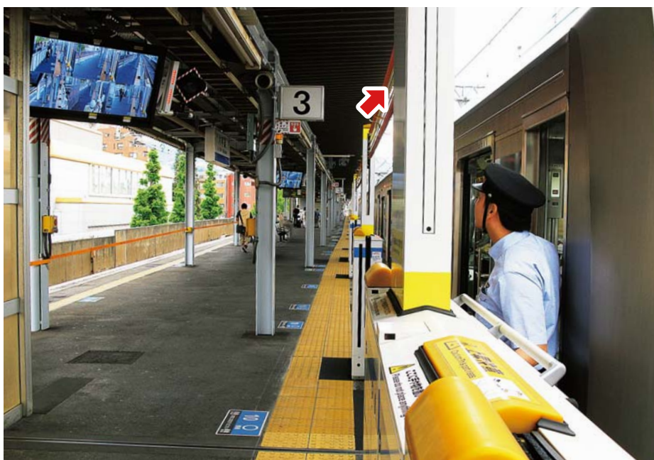
The elevating platform gates (red arrow) made it difficult for conductors to confirm the situation on the platform, but the display images (Platform Monitor for Conductors, pictured at the upper left) provides clear visibility for a safer train service.