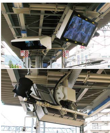
▲ A comparison of a conventional display and the newly installed TH-47LFX60.

(Top photo) Conventional displays (pictured at the left) used a large housing and canopy to block sunlight and provide dust and water resistance, for highly visible images. The TH-47LFX60 (pictured at the right) can be installed by itself, and provides superb dust and water resistance, as well as highly visible images.