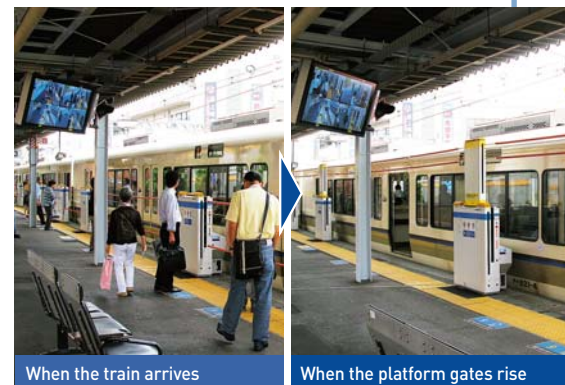
When the train arrives

The Elevating Platform Gates installed at the station's platform (pictured at the lower, with the red arrow) rise whenever the train's doors open upon arrival at the station, making it difficult for the conductor to confirm the passenger status at the front cars of the train. As a countermeasure, JR West Japan has decided to install a camera near each of the train doors on the platform to provide a display, and to introduce the Platform Monitor for Conductors to enable conductors to confirm passenger safety. Initially, a 42-inch display attached to a housing for outdoor use was scheduled to be used for the image display, but size and weight posed a challenge, as the display and housing combined exceeded a weight of 100 kg.