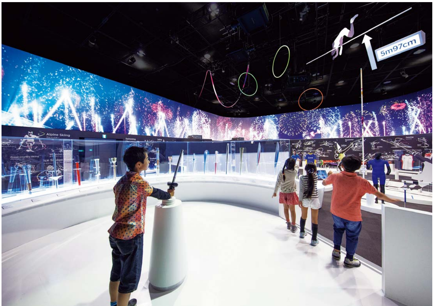
Super Wide Vision on the walls of the exhibition hall.

visitors feel as if they were in a real stadium. The images are projected by four PT-DZ21K projectors and two PT-DZ8700 projectors. The edge blending technology is used to process the images projected by the six projectors to provide a wide, seamless image to lure visitors into the virtual stadium.