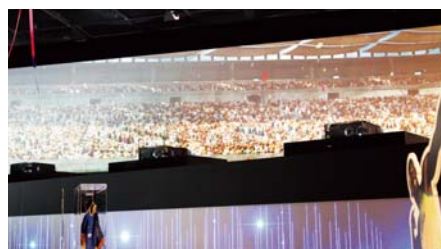
▲ Three PT-DZ870 projectors atop the box enclosure