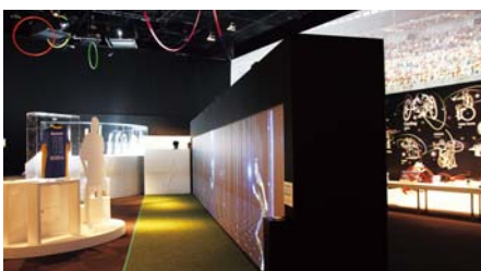
▲ Compact box enclosure with a short depth