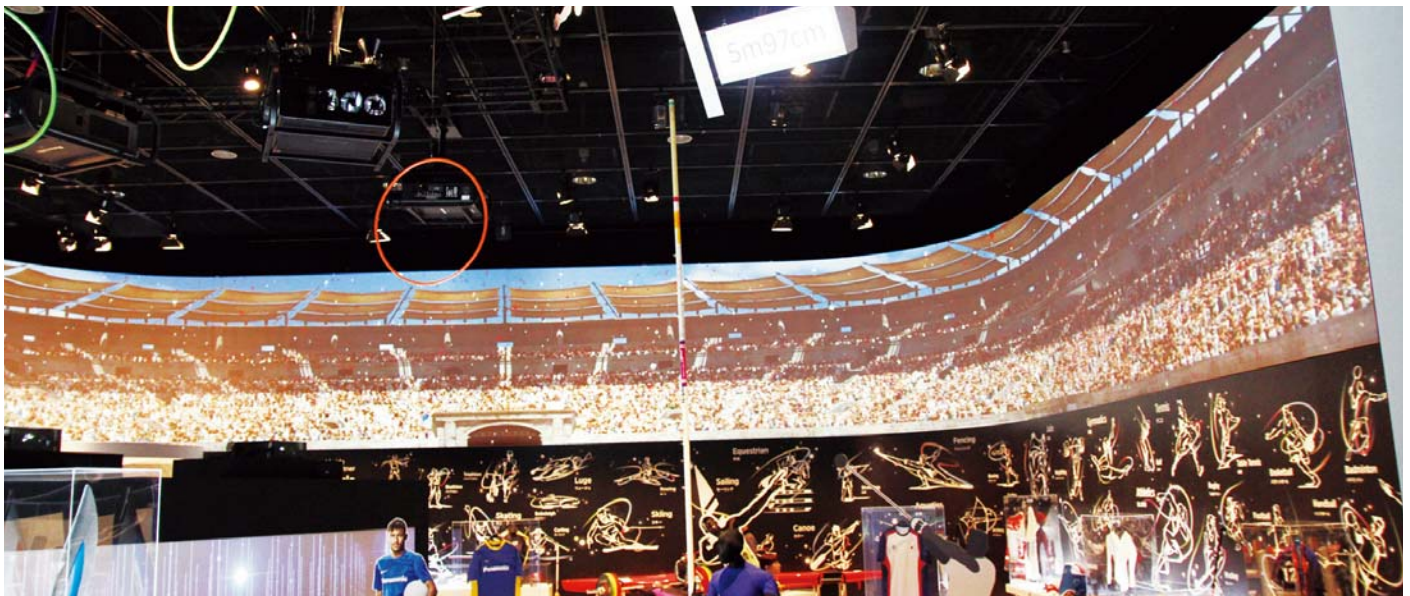
▲ Super-wide image projected by six projectors.