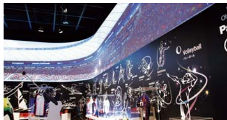
▲ A Light ID is utilized to transmit the recorded information of displayed items.