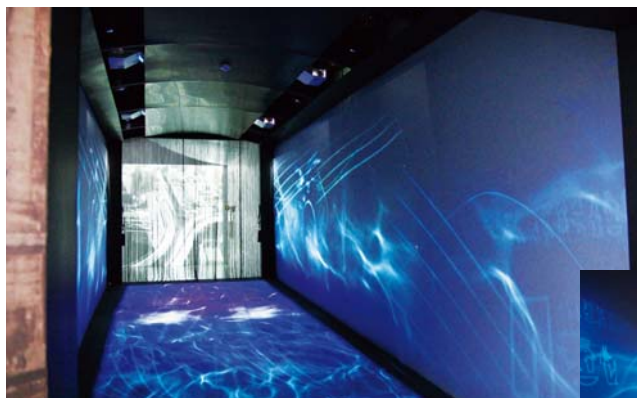
▲ Six short throw projectors mounted on the ceiling.

The passageway to the hall, dubbed "Time Trip Corridor," takes visitors on a virtual time-space travel from ancient years through modern days. The right and left walls and the floor are covered with images. Six short throw projectors are used to project images on the side walls of the passage, and one projector projects an image on the floor. A total of seven Space Players project images to create the illusionary space.