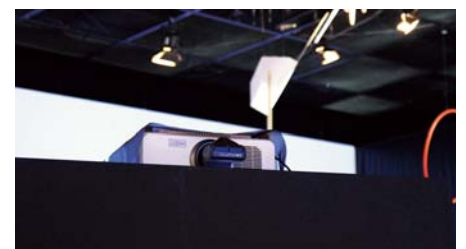
▲ Projector mounted with the ultra short throw ET-DLE030 lens