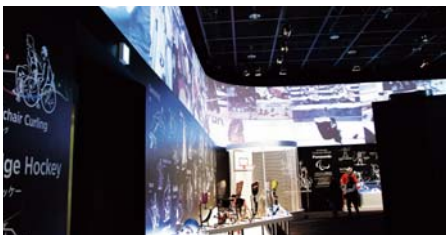
▲ The hall filled with information of various sports competitions and display of sports items and uniforms. The wide screen is installed above the displayed items.