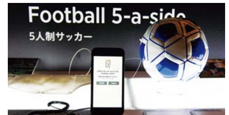
▲ Smartphones for receiving light ID are arranged at various locations in the venue.