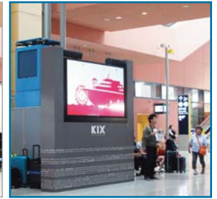
▲ One of the Welcome Boards, before replacement (left) and after replacement (right). The structure was overhauled as well, making the large screen even more attention-getting.

A control computer in the Centralized System Management Center in the New Kansai International Airport Company Building adjacent to Terminal 1 is used to schedule the content display and edit personal welcome messages and emergency information. This computer controls and manages the content-playback computer over an in-airport network. The displays used thus far weighed approximately 189 kg, and that made removing them quite hard work. By contrast the new 98-inch LCD displays are much lighter at around 136 kg, and installing them was a breeze.