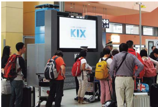
A Welcome Board is located right in front of you when you come out of the international arrivals gate. The large screen has a major impact, and due to its noticeability is frequently used as a meeting or gathering point.

A control computer in the Centralized System Management Center in the New Kansai International Airport Company Building adjacent to Terminal 1 is used to schedule the content display and edit personal welcome messages and emergency information. This computer controls and manages the content-playback computer over an in-airport network. The displays used thus far weighed approximately 189 kg, and that made removing them quite hard work. By contrast the new 98-inch LCD displays are much lighter at around 136 kg, and installing them was a breeze.