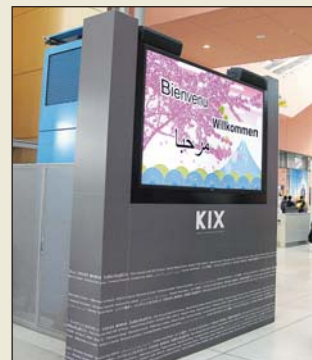
◀ The TH-98LQ70 units installed feature IPS panels with a wide viewing angle. The picture appears crisp, and the colors vivid, even when seen from a diagonal direction.