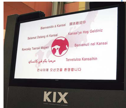
The message "Welcome" is displayed in many different languages. A wide range of other video content, such as seasonal scenery and famous tourist sites, also welcomes visitors from overseas to Japan

Large-screen displays with outstanding image playback performance, able to display the same HD video content as their predecessors even more crisply and beautifully