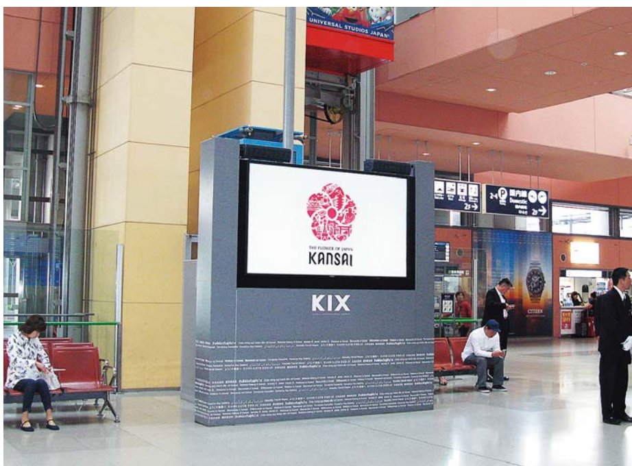
A Welcome Board, upgraded to a 98-inch 4K UHD LCD display

A demonstration using the actual equipment was staged for the client, who had a highly positive response not only to the ultra-high resolution 4K imaging using the next-generation image processing technology Detail Clarity Processor 3, but also the fact that the HD content already in use could be displayed more beautifully with image correction and increased clarity. Also noting the fact that it is appropriate to have displays made by a Japanese manufacturer welcoming visitors at the "gateway to Japan," two Panasonic TH-98LQ70 displays were installed.