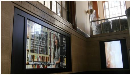
The new 98-inch 4K display alongside one of the two accompanying 65-inch Full HD panels (TH-65LFE8).