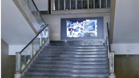
The 4K display in RIBA's reception.