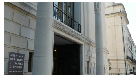
RIBA's historic base in Portland Place, Marylebone.