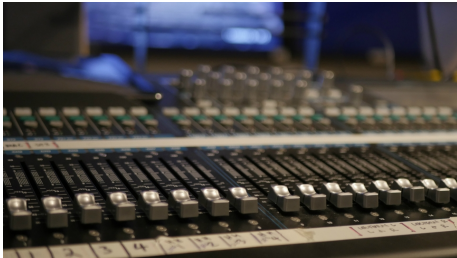
The 32-channel mixing desk provides control for the whole auditorium, including the Panasonic projector.

With a depth of less than 62 mm, its slim design allows for discreet installation when wall mounted, and, along with the narrow bezel, helps viewers concentrate on the displayed image.