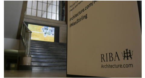
RIBA's reception featuring the new 98-inch 4K Panasonic display.

The LFE8 Series can be mounted in landscape, portrait, or multi-screen configurations and are often used for menu boards and town guide displays.