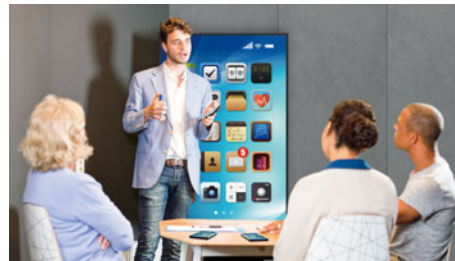
Easy to see by large groups such as an instructional course

With a normal display, images are displayed on part of the screen