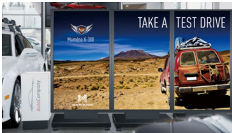
Optimal for giant eye-catching displays for promotions and event notification

Use individual screens to display welcome boards and product introductions