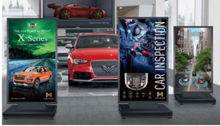
Simultaneously display new car information, services and information

Normally, a mobile stand is used to display information on each screen. During an event, combine three displays to create a large screen.