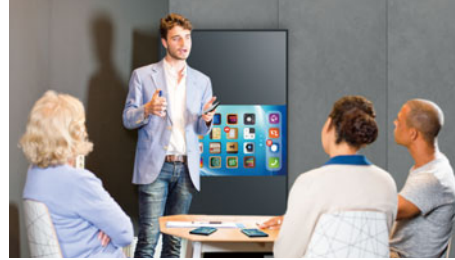
The icons are difficult to see, and the display size is not being utilized properly

App screens can be shown fully on the display, so they can be seen by multiple people without having to peer over a smartphone screen.