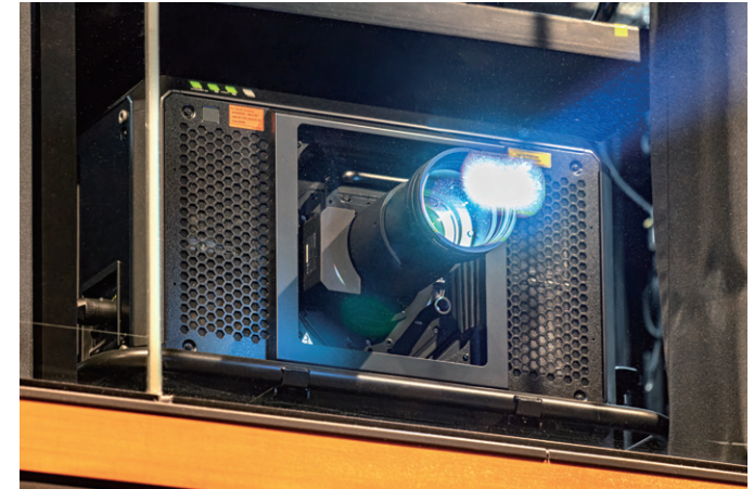
▲ The PT-RQ50K fitted with zoom lenses ET-D3QT700 and ET-D3QT800 as projection lenses.