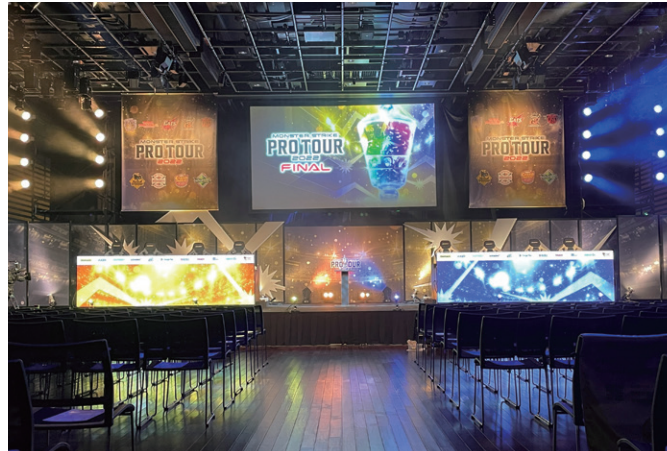
▲ The MONSTER STRIKE PRO TOUR 2022 Final was held at EBiS303 in December 2022. The main image in the center of the stage was projected by the PT-RQ50K.