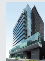
▲ EbiS Subaru Building