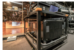
◀ Power to the PT-RQ50K in the projection room can be controlled from the venue with the remote control, which is highly-regarded for its user-friendly UI.

According to Mr. Fumiya Sato, "The PT-RQ50K is a major draw that helps set EBiS303 apart. For example, we have customers who have made repeat reservations after seeing the visual appeal of the images it projects. This high-brightness projection was particularly impactful in the success of the MONSTER STRIKE PRO TOUR 2022 Final esports tournament last December. The main image was projected in the center of the stage, while the sub images were shown on an LED panel supplied by the customer. The bright, vivid images provided to the audience with the projector were more than a match for those on the LED panel. The customer also appreciated the fact that a large LED panel was no longer needed for the main video, making the setup more cost and time efficient."